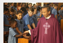
2019 Ash Wednesday Mass

See the latest photos on the school website: