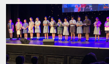
2019 Lifted Live