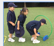
2019 Project Compassion Day

PHOTO GALLERY: See the latest photos on the school website: