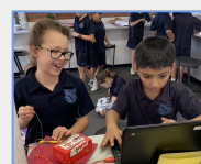
Makey-Makey's at OLOL