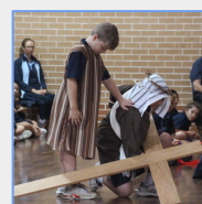
2019 Holy Week