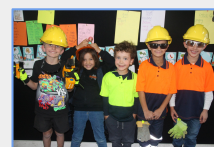
2018 International Family Day