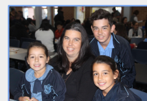
2018 Mothers Day OLOL

See the latest photos on the school website: