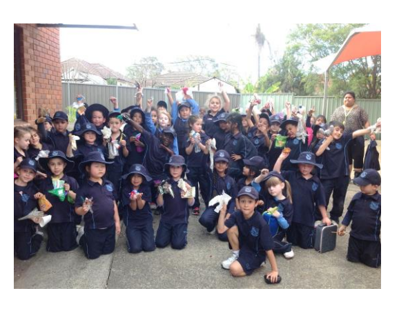
Year 1 weeding the gardens in the school