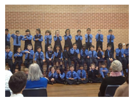
Kindergarten singing for the Over 50's