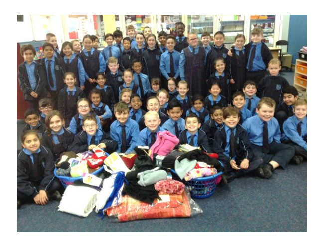
Year 3 creating care packages including socks and scarves to donate to the homeless

CONGRATULATIONS OUR LADY OF LOURDES. THROUGH YOUR GENEROSITY AND ACTIONS, YOU HAVE MADE A DIFFERENCE TO THE LIVES OF OTHERS.