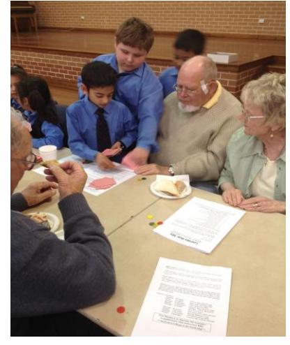
Year 2 playing games with the Over 50's