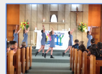
2018 All Saints Day Mass

PHOTO GALLERY: See the latest photos on the school website: