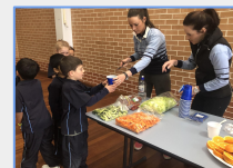
2018 Infants Fruit Salad Rainbows