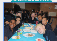
2018 June Principal Morning Tea