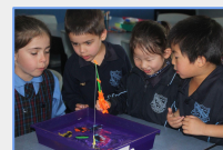
2018 Stage 2 Game Design